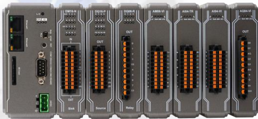
(I/O modules not included)